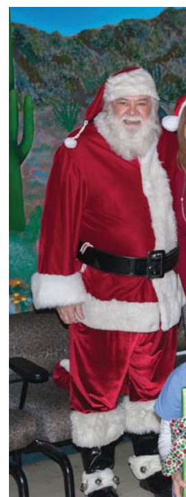
Emp... Back: Sa... Fro...